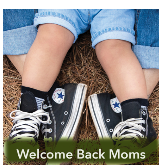
Come out to our kick off this month. To learn more and register, click here.

Group life provides us with a safe space to strengthen our walk with Christ, grow closer to others and become equipped to make an impact in the world around us. Rooted is a 10-week group discipleship experience and a catalyst for lifechange. It provokes questions, fosters conversations and provides group experiences designed to give you a glimpse of your story in God's plan. At Christ Church, we believe that God designed us to live in community. We invite you to explore our Rooted groups this fall. To learn more and to register for these free groups, click here.