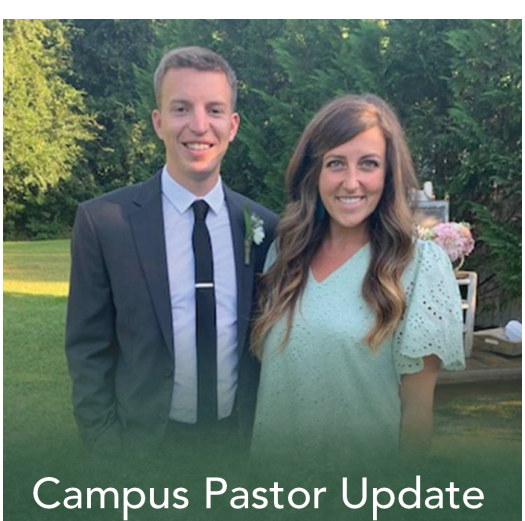
Please register your kids Check out the latest news on our Butterfield campus. Read the full letter here .