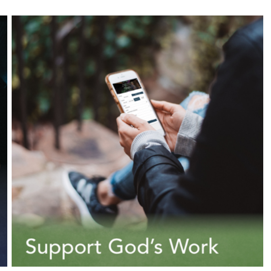
We are grateful for your generous support. To give now, click here.